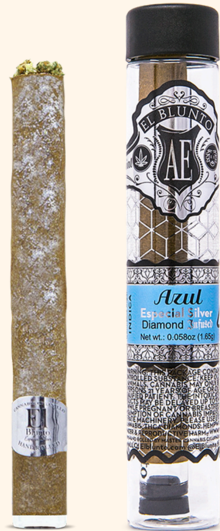
El Blunto Silver Flower Only 1.5g Hash / Diamond 1.65g