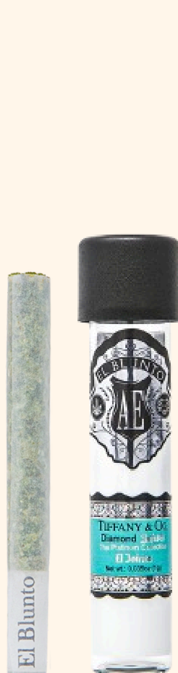
El Jointo Hash / Diamond 1g