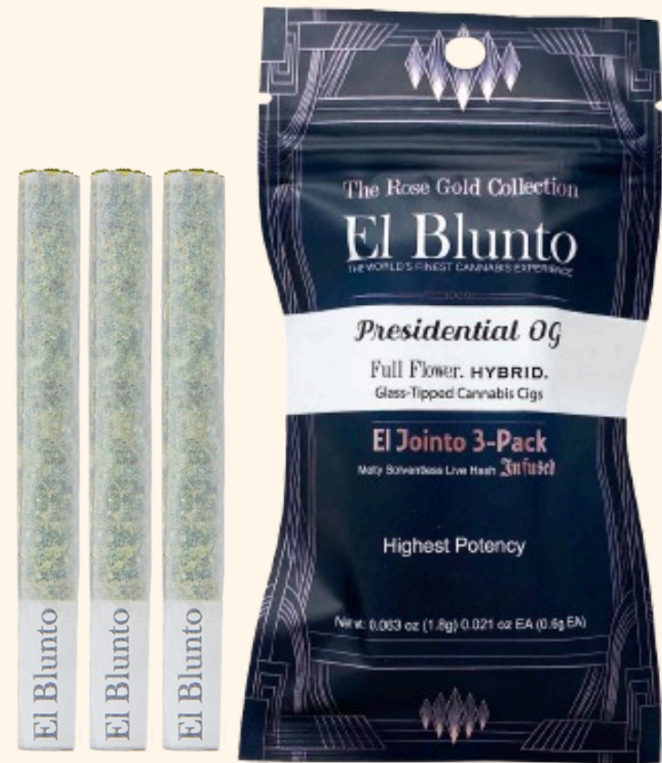
El Jointo 3pk Hash / Diamond 3 x .6g