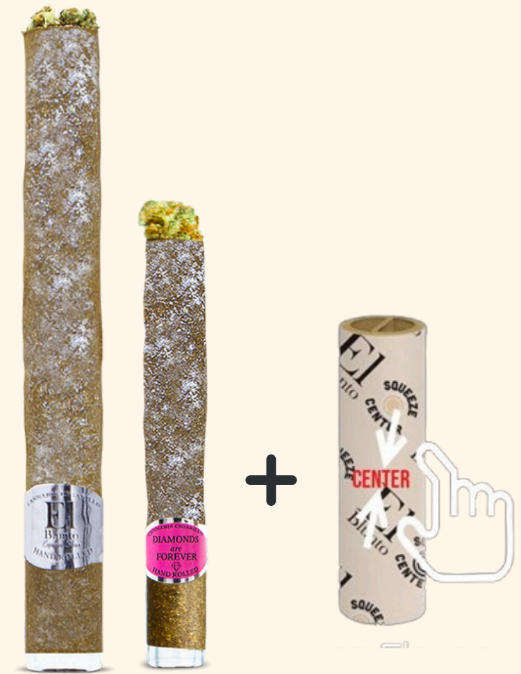
Coming Soon. El Blunto X FlavorCore