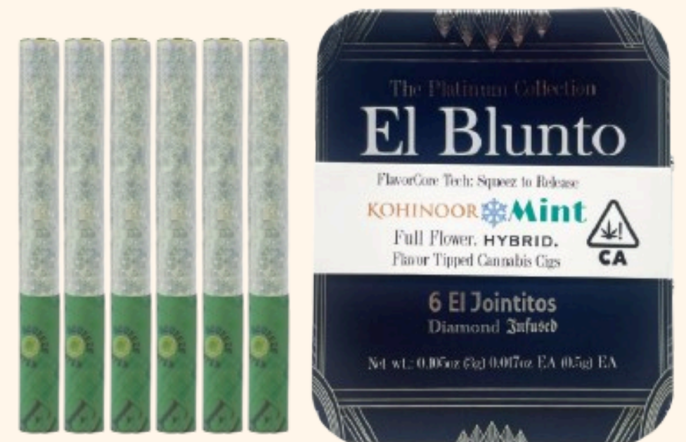
El Jointo FlavorCore 6pk Hash / Diamond 6 x .5g