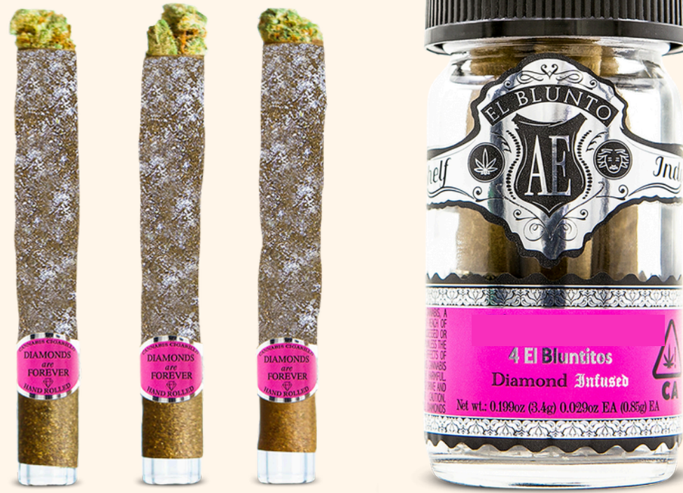
El Bluntito 3pk Silver Flower Only 3 x .75g (2.25g) Hash / Diamond 3 x .85g (2,25g)