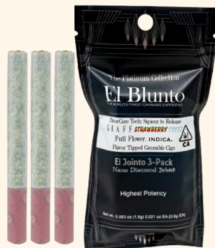
El Jointo FlavorCore 3pk Hash / Diamond 3 x .6g