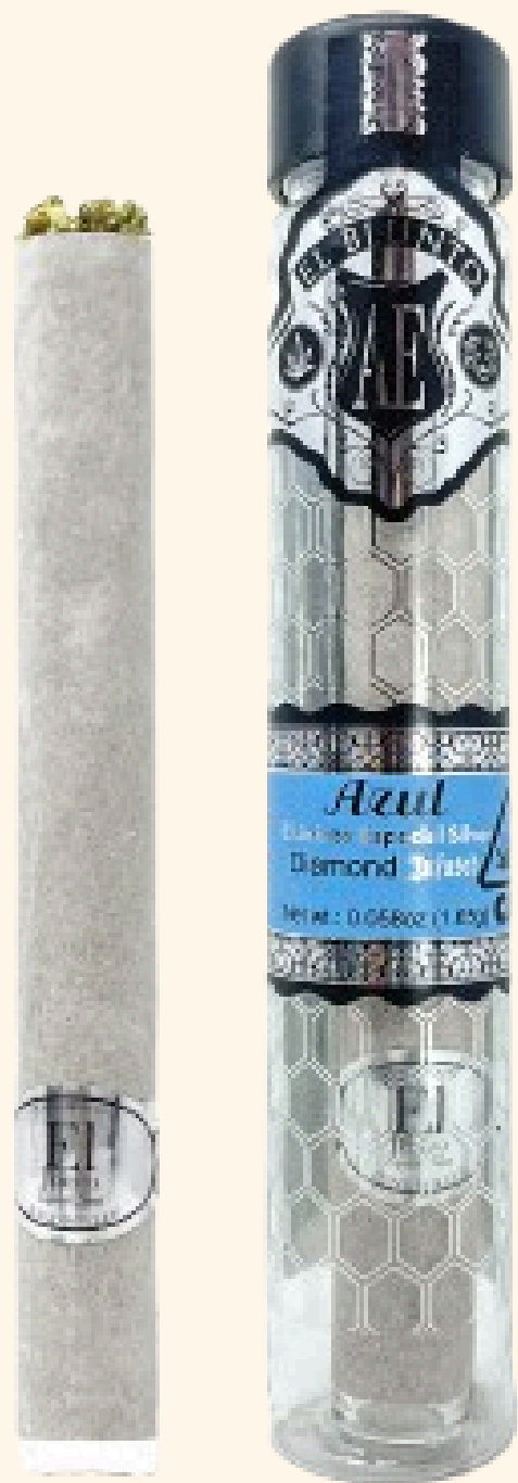
El Jointo Whole Flower Diamond 1.65g