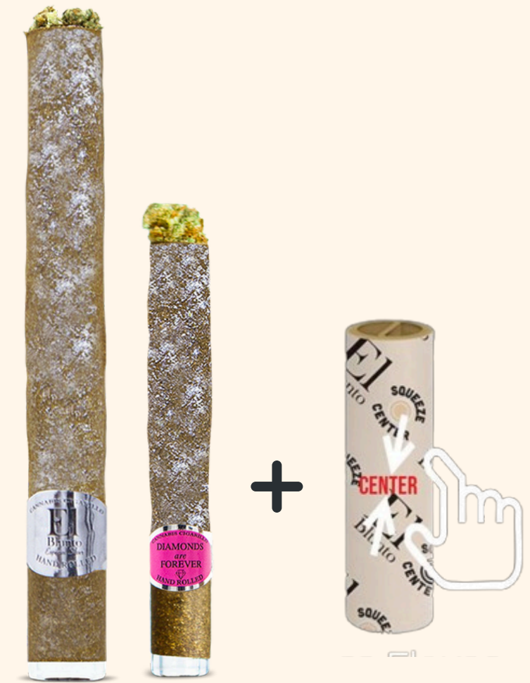
Coming Soon. El Blunto X FlavorCore